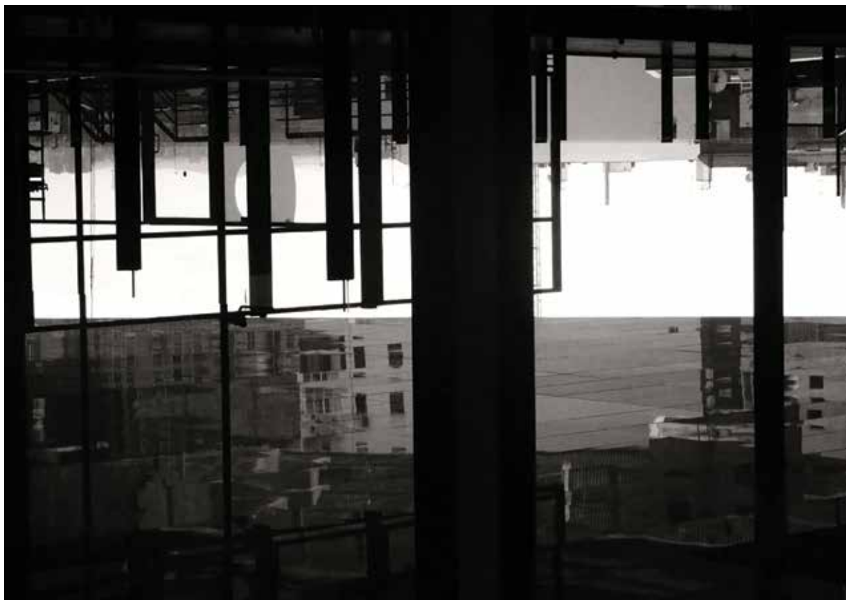
Solenne Hyllemose Tyngdekraft , 2015