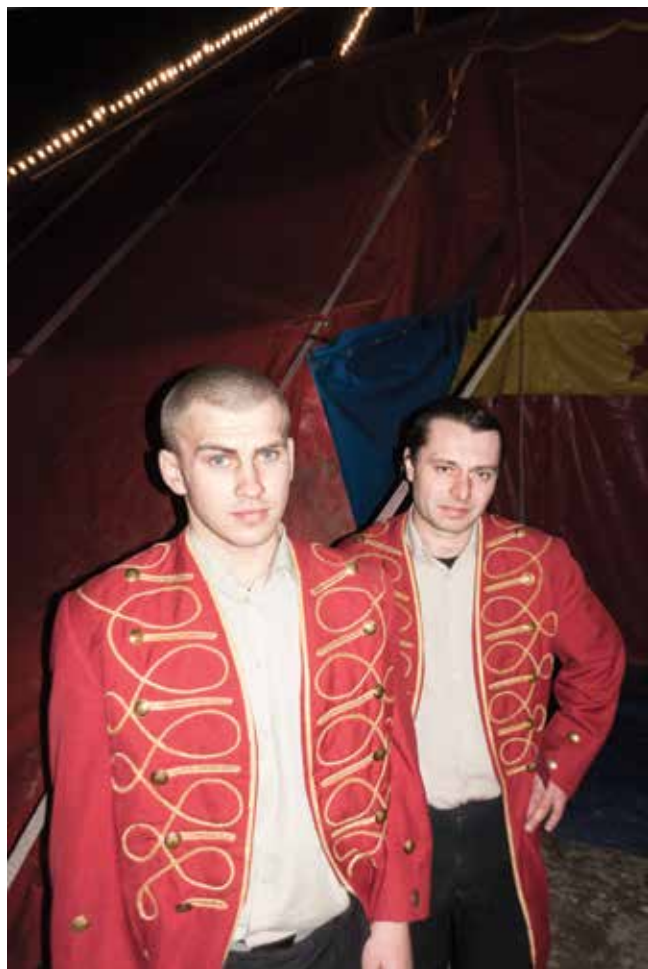
Petter Wessel Eid Cirkus 1 & 2 , 2016